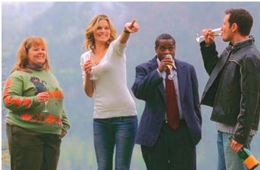
Pretty Ugly People

Apple just wants to to lead a normal life but his friends Banana, Grape and Barky the Tree are trying to keep him down.