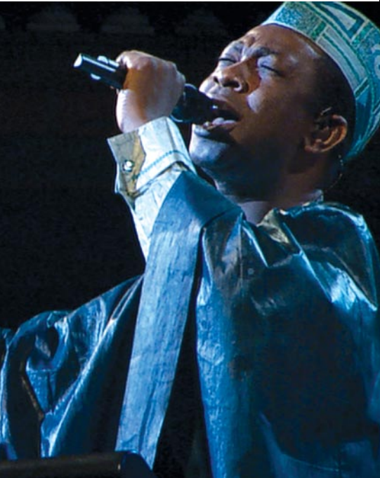
Youssou Ndour: I Bring What I Love

The film follows the famed singer over several years as he conceives, records and releases the album. While Egypt received critical and commercial success in the West, it was met with extreme backlash in Senegal. The furor reached a fever pitch when Youssou chose to perform during Ramadan. The film effectively places Egypt into context and explores the questions and issues surrounding Egypt with sensitivity and honesty transitioning seamlessly between the exploration of his faith, production of the album and blazing concert footage. His warm presence is as much a delight to watch as his beautiful, tenor voice is to hear. The performances are incredibly shot and mesmerizing, from wild shows at his nightclub in Senegal to the spiritual ecstasy of his Carnegie Hall concerts to the sheer hilarity of a promoter in Ireland informing the audience that they have to finish their pints before the band will start. A loving portrait of an iconic artist, expect to have your horizons broadened and your soul lifted while enjoying some of the finest music in the world!