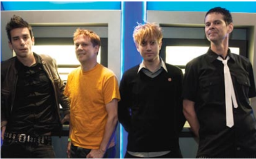
Pansy Division: Life in a Gay Rock Band