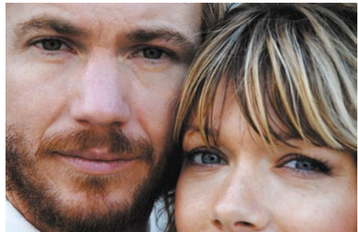
A Quiet Little Marriage

When Dax discovers the deceptive extent to which Olive will go to conceive, he counters with an