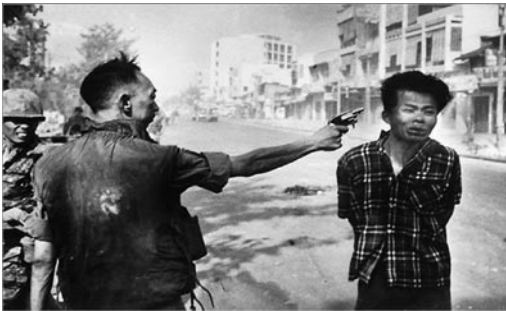
An Unlikely Weapon