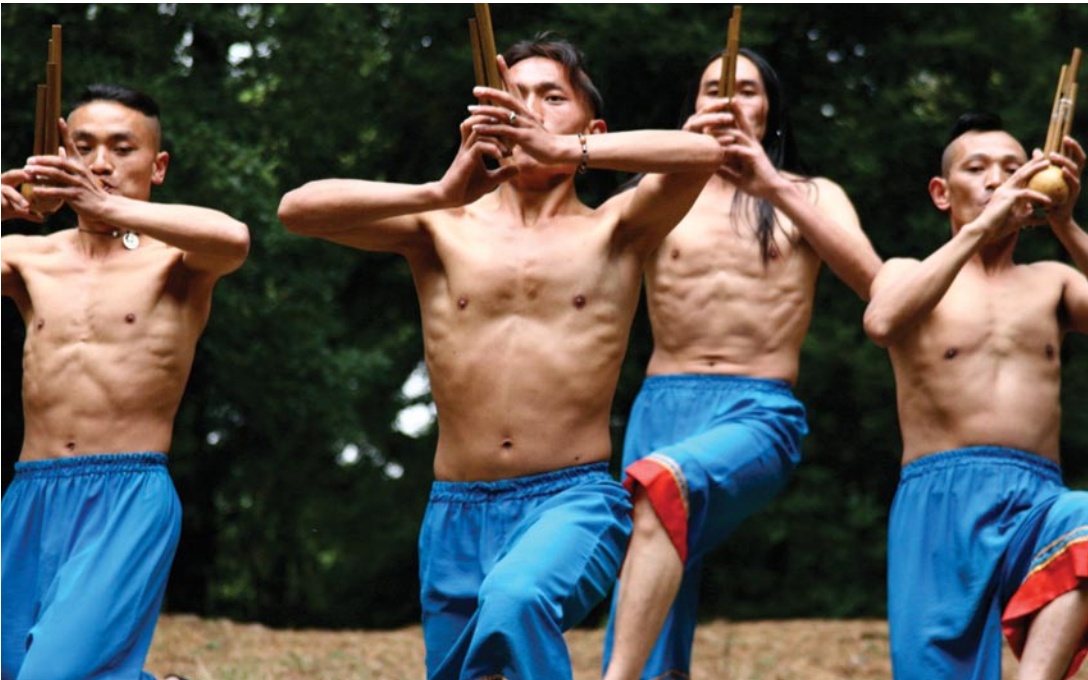
1 Giant Leap: What About Me?

DJ Dragonfly will be throwing down “ethno-funky, trans-global, bass-bonkin’ grooves for the modern- day dancefloor dervish” after the screening! Fusing that concept to the masses is his self-defined genre of “Gaiatronic Grooves,” a signature mix combining funky thumpin’ breaks and bangin’ tribal house with a decidedly global influence of samples and sound smatterings from India to Africa by way of multiple sound sources including electronic percussion and didgeridoo.