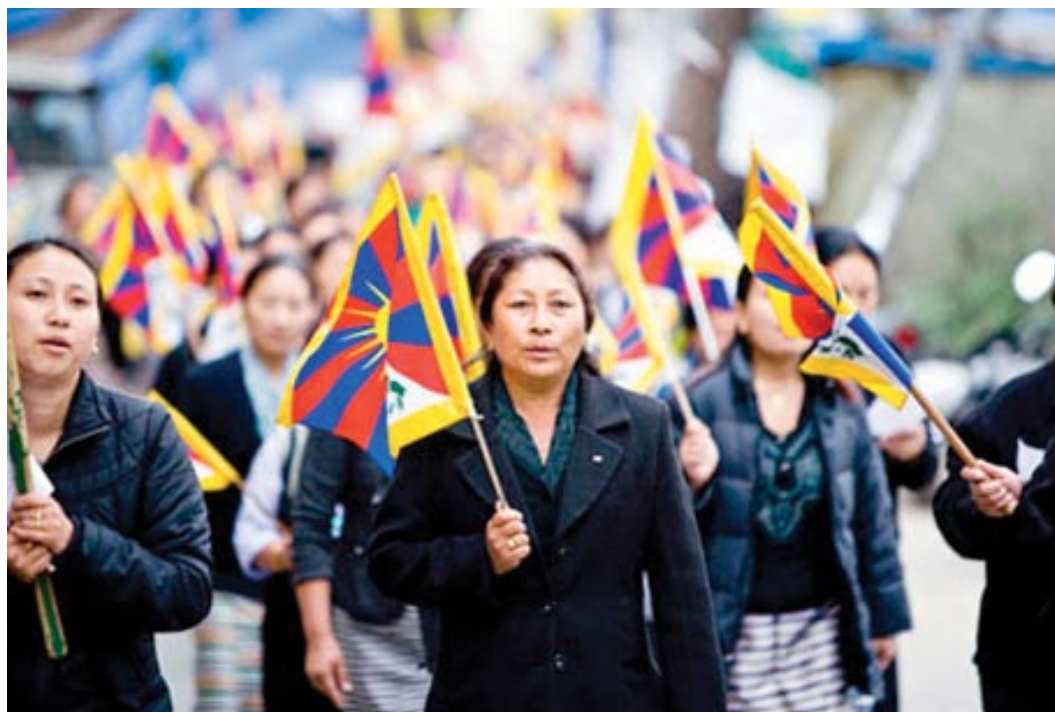
Tibet's Cry for Freedom