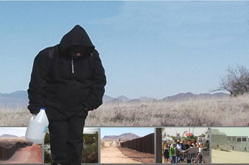
The Border Wall