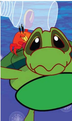
The Plastic Perils of the Pacific