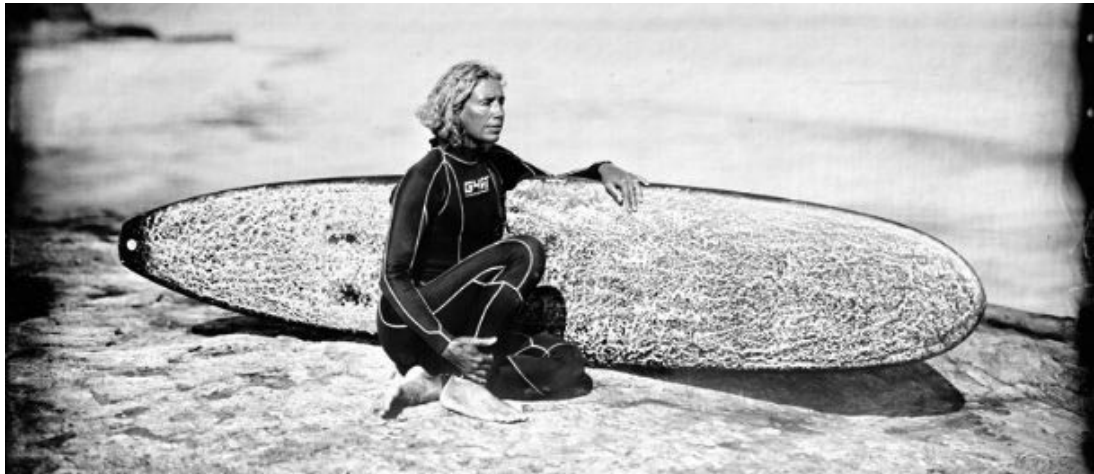
The Women and the Waves

The naked face of hunger is revealed for what it is; a horrific, sickening scourge of humanity that could and should be eliminated. Get ready for a slam dance.