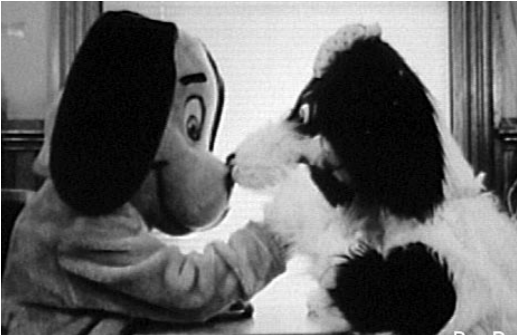
Dog Days of Winter

Have you ever wondered why we don’t ride zebras? Or why we aren’t drinking moose milk or eating hippo hamburgers? Follow a young zebra as he discovers the one thing keeping him from becoming a domesticated animal.